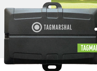
TAGMARSHAL CLASSIC INSTALLED DEVICE